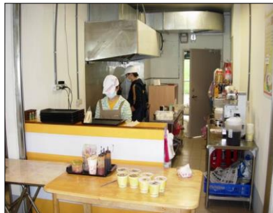
High Spirit Breakfast Shop