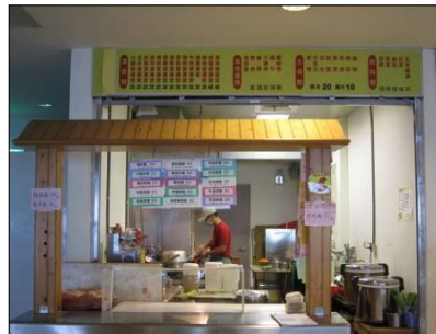
High Spirit Diner