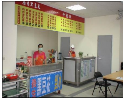
818 Snack Bar